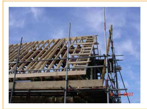
Re-roofing underway at Tunstall

Work is well under way at the second contract secured for Greenwell Farms, this time comprising the conversion of a number of redundant agricultural buildings to a house. The house will be known as Geaters Barn when it is finished, and will have a large enclosed courtyard garden to the rear with a range of garages and stores. Internally, approximately two-thirds of the building will be open to full height. The house's accommodation includes five bedrooms, three bathrooms, sitting room, kitchen, dining room, study and library. You can read about it online at www.gedgrave.co.uk/page/geaters-barn-459