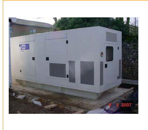
New 5 ½ tonne generator installed to provide back up power for the full hospital site should the mains be disrupted