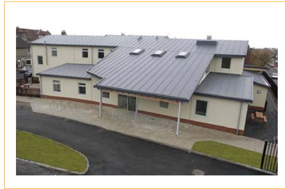
The complex roof of Kirkley Children's Centre, Lowestoft