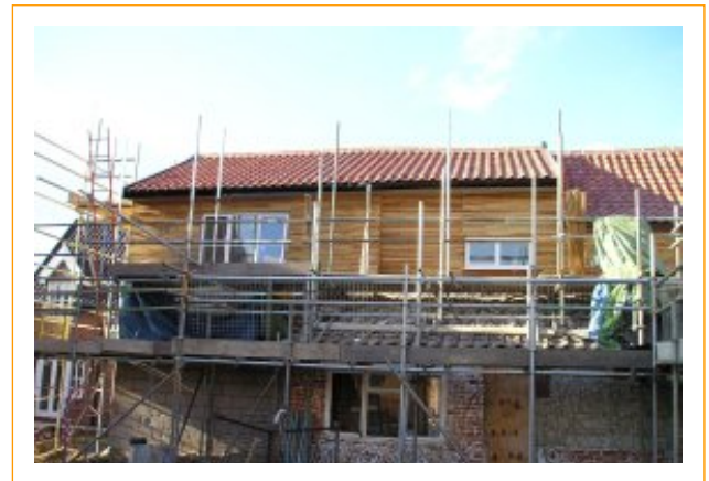
Oak lathes in place prior to replacement render