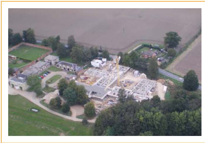
Taking shape ~ 13 th September 2007