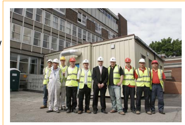
The Team at the official opening of the Ipswich Suite