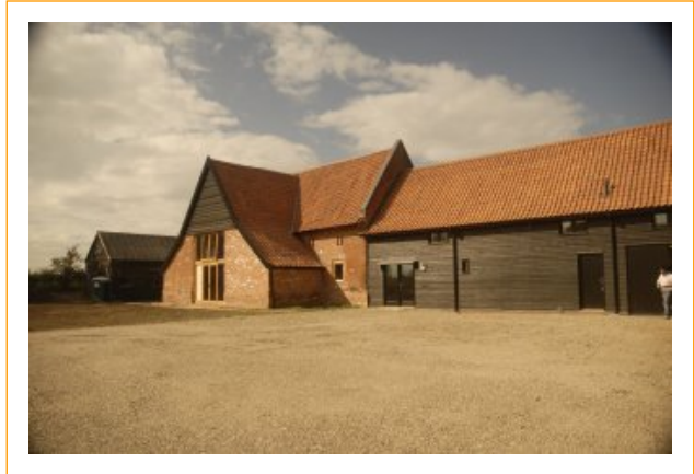
The Barn just before completion and handover